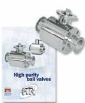
HIGH PURITY BALL VALVES