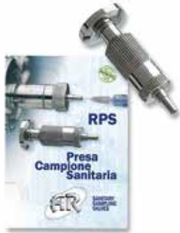
SANITARY SAMPLING VALVES