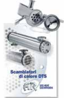
DTS HEAT EXCHANGERS