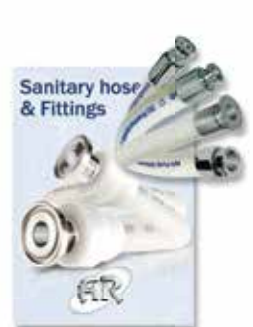
SILICONE HOSE & FITTINGS