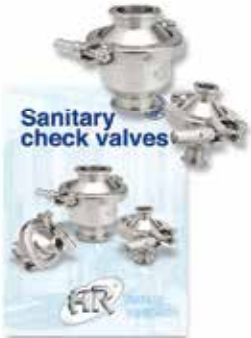
SPRING CHECK VALVES