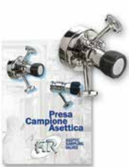
ASEPTIC SAMPLING VALVES