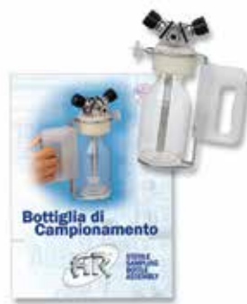
SANITARY SAMPLING BOTTLE