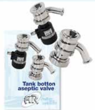
TANK BOTTOM ASEPTIC VALVE