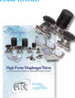
ITT DIAPHRAGM VALVES