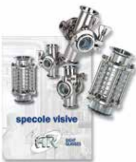
SIGHT GLASS-FLOW INDICATOR